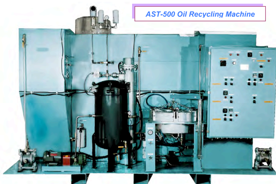
AST-500 Oil Recycling Machine