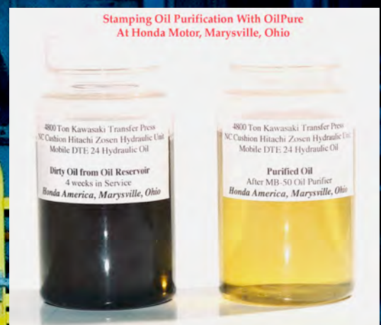
Honda is a registered trademark of Honda Motor Company.